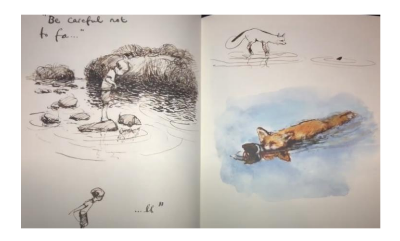
Day 3. Listen to the story again and stop at this page:

1. How and why has your view of the fox changed at this point?