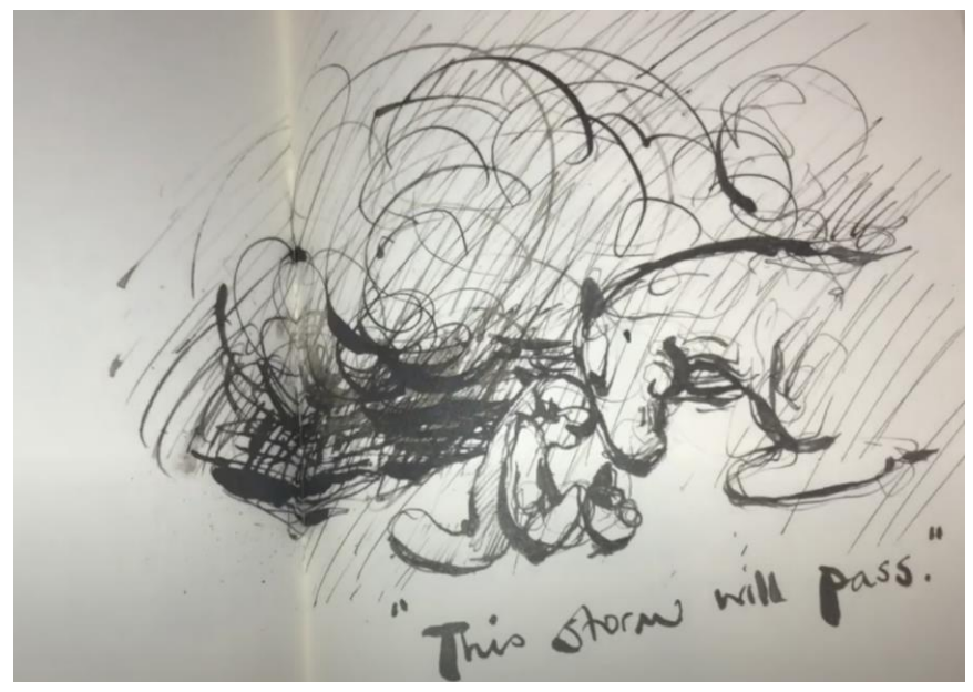
Day 5: Listen to the story again and stop at this page:

1. How do you think this relates to the times we are living through now?