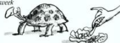
TORTOISE NO. 6 weight 23 ounces