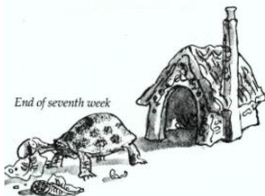
TORTOISE NO. 8 weight 27 ounces

Alfie's weight was thirteen ounces. Tortoise Number 8 was twenty-seven ounces. Very slowly, over seven weeks, Mrs Silver's pet had more than doubled in size and the good lady hadn't noticed a thing.