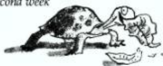
TORTOISE NO. 3 weight 17 ounces